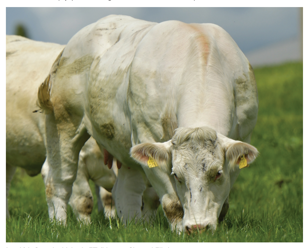
Lot 104: Coraghy Makayla ET (Major x Claregal Ellie)