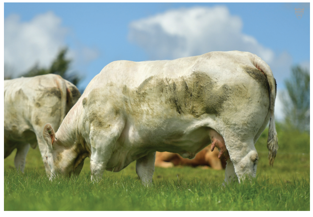
Lot 99: Coraghy Jonquille (Fauchon x Galere x Dilemme)