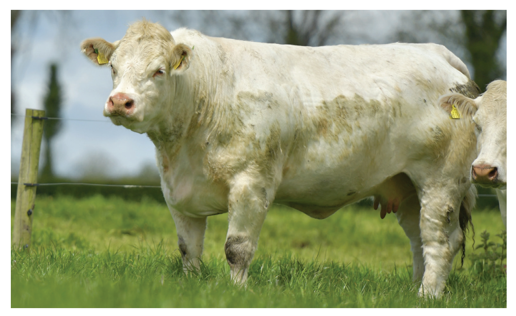
Lot 100: Goldies Joy (Kiladeas Legend x Goldies Ambassador)