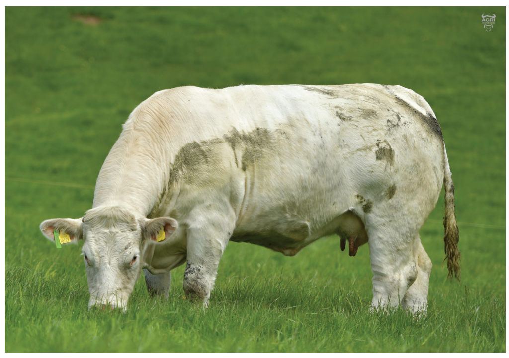
Lot 107: Coraghy Nadine (Goldstar Echo x Liscally Blossom x Padirac)